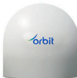
Gaia 100 4.5 m