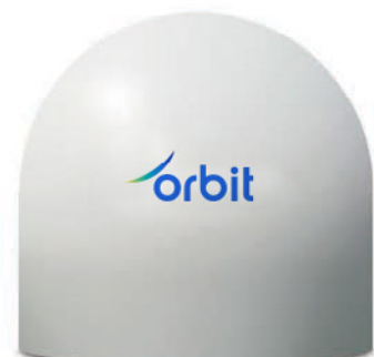
Gaia 100 5.5 m