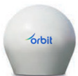
Gaia 100 2.4 m

The Gaia 100 family is available in 4 antenna sizes: