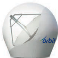
Gaia 100 3.7 m